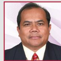
ROGELIO FILIPINO Food Manufacturing