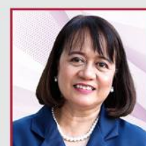
LUZ FILIPINAS S. SAN PEDRO Metal Engraving