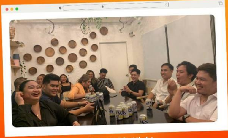
Fellowship Night September 23, 2023